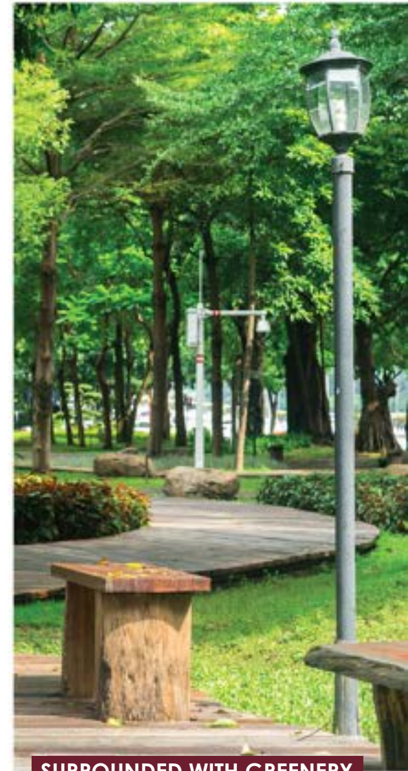
SURROUNDED WITH GREENERY