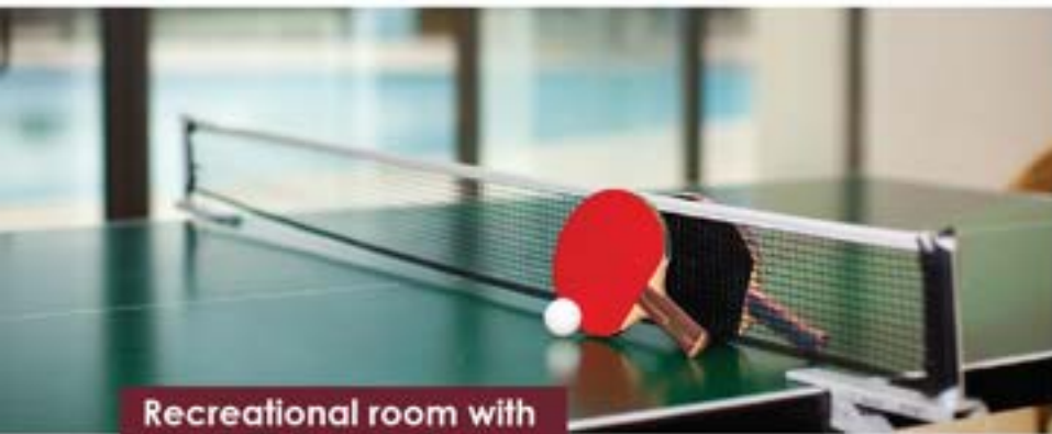
Recreational room with Pool, TT, Board Games